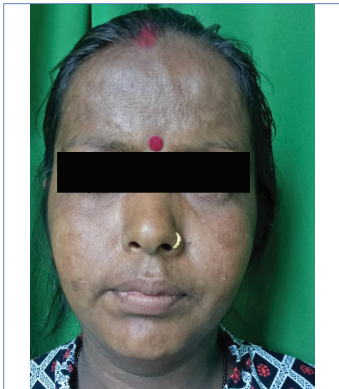
[Table/Fig-2b]: Healed lesions three months post-treatment.